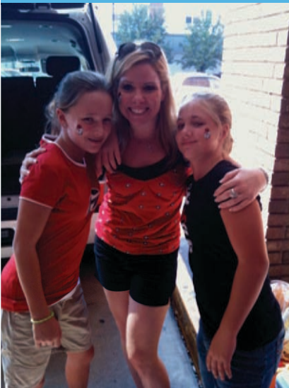
Me and my two nieces (and future DG's) at a UGA Football game this Fall