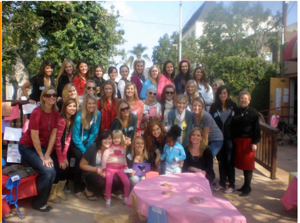
DGs from the Southern California at the Los Angeles Blind Childrens Center